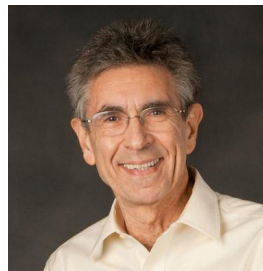
Robert J. Lefkowitz, M.D. Professor, Duke University Medical Center; Nobel Laureate