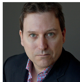
John Carreyrou Pulitzer Prize-Winning Journalist & Author