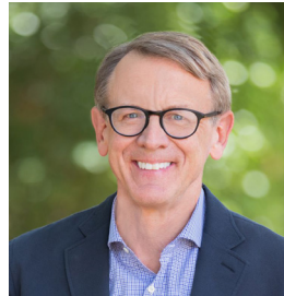
John Doerr Chairman, Kleiner Perkins