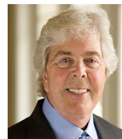
Herbert W. Boyer, Ph.D. Founder Genentech

In the coming year, we are excited to join our Life Science and Tech Conferences together -- demonstrating the strength of the entrepreneurial ecosystem in North Carolina.