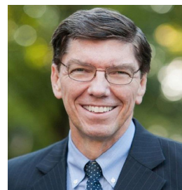
Clayton Christensen Professor Harvard Business School