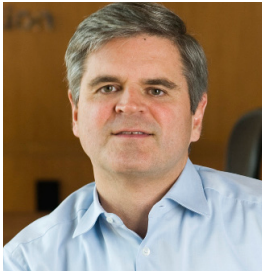
Steve Case CEO, Revolution LLC; Chairman, Startup America Partnership