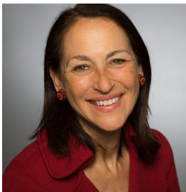
Margaret Hamburg, M.D. Commissioner U.S. Food and Drug Administration